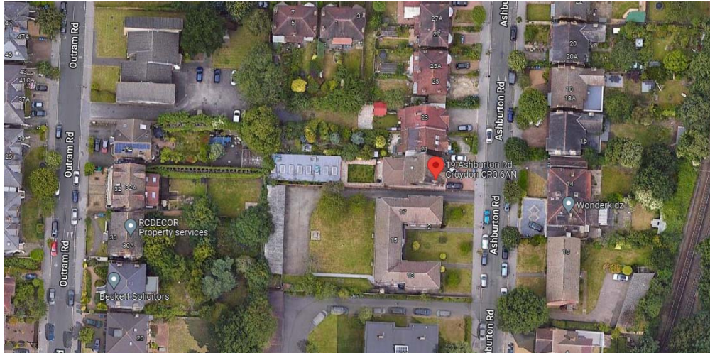
Figure 1 – Google maps view of site